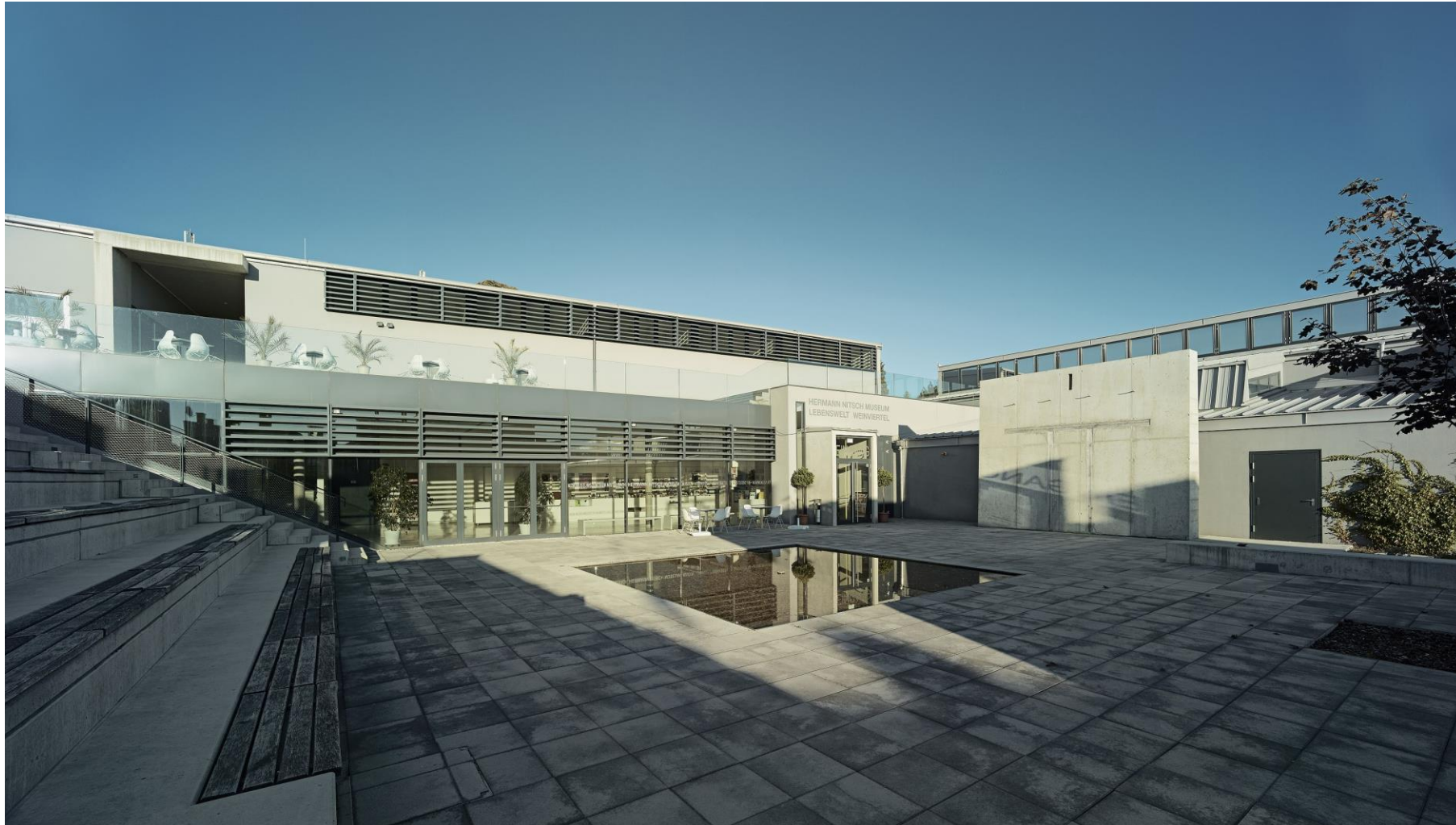
Hermann Nitsch Museum