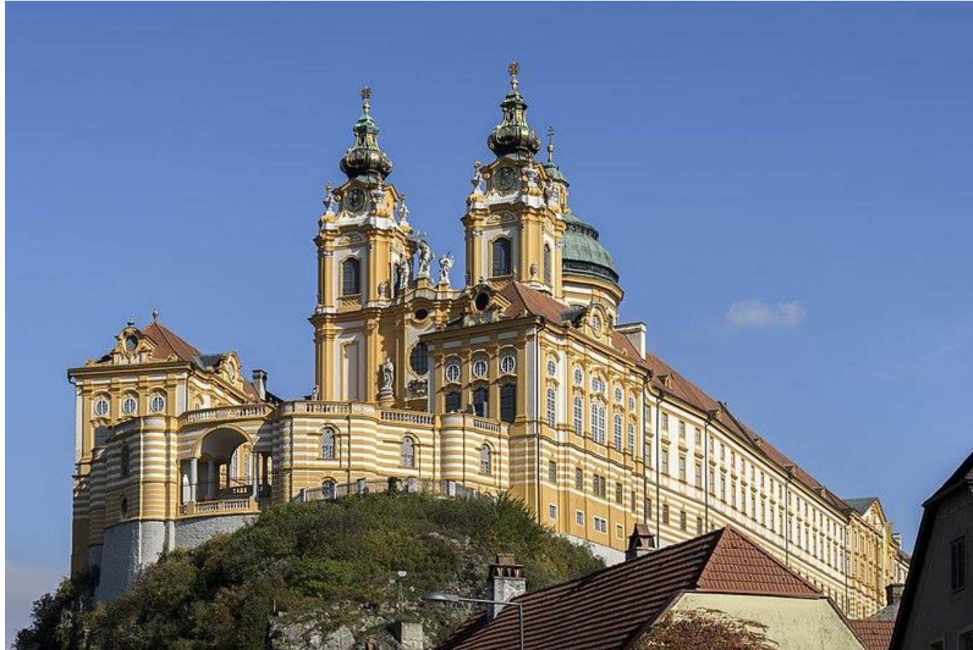
Melk Benedictine Abbey